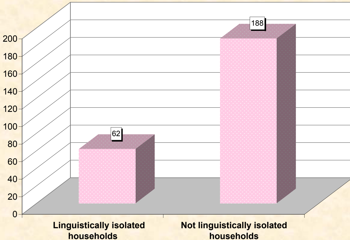
Chart 2 -- Linguistic Isolation of Spanish Language Households Sherman County, Texas

Note: A linguistically isolated Spanish language household is one in which no member 14 years old and over (1) speaks only English or (2) speaks Spanish and speaks English "very well." In other words, all members 14 years old and over have at least some difficulty with English.