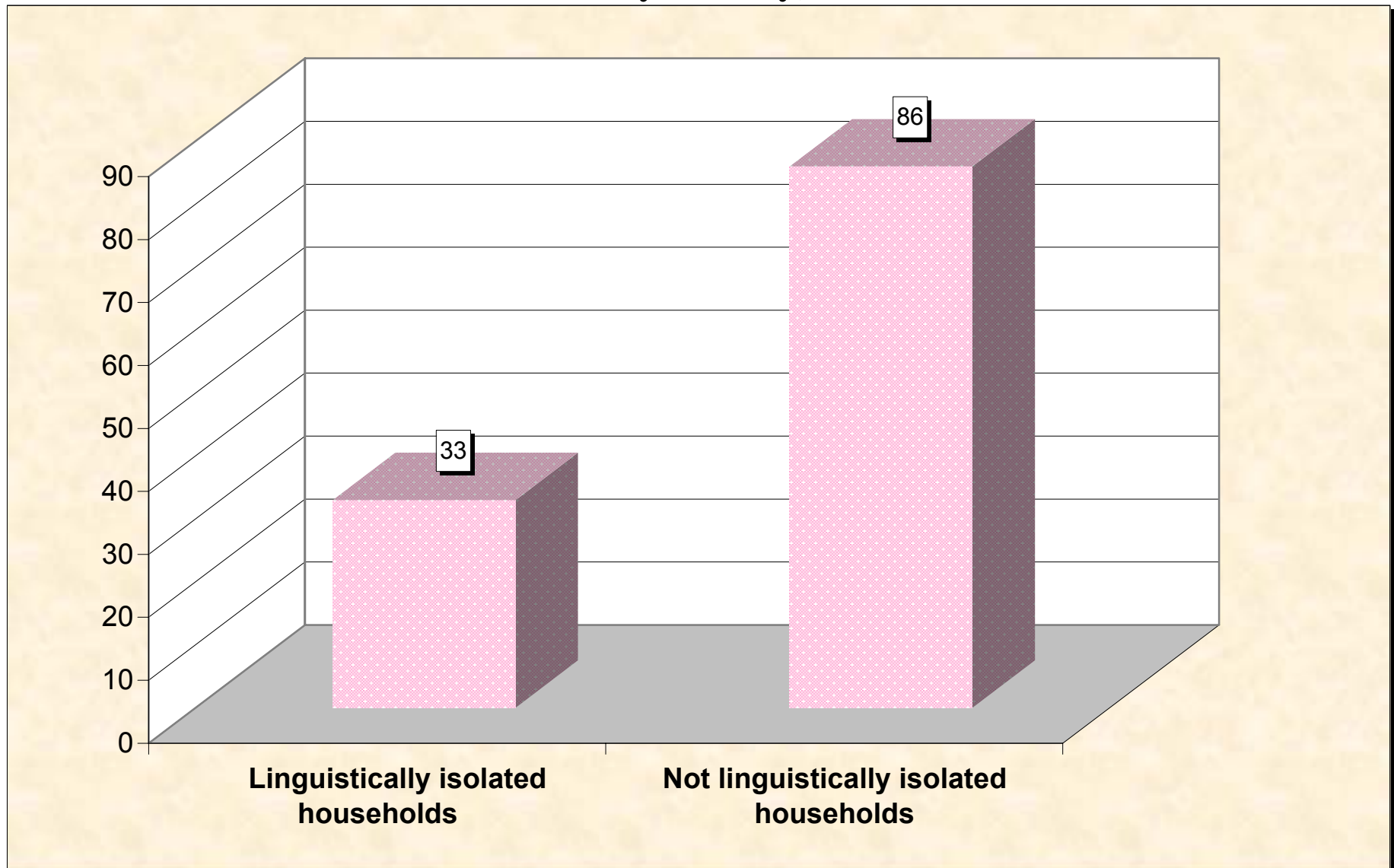
Chart 2 -- Linguistic Isolation of Spanish Language Households Kenedy County, Texas

Note: A linguistically isolated Spanish language household is one in which no member 14 years old and over (1) speaks only English or (2) speaks Spanish and speaks English "very well." In other words, all members 14 years old and over have at least some difficulty with English.